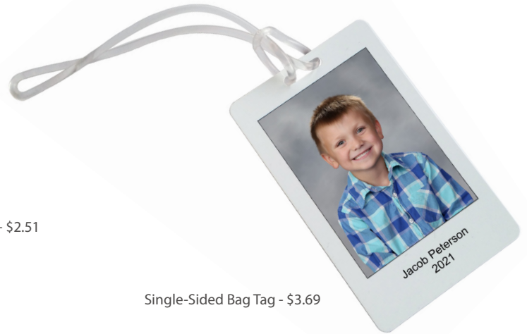
Single-Sided Bag Tag - $3.69