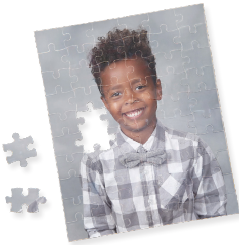
8x10 Puzzle - $9.77