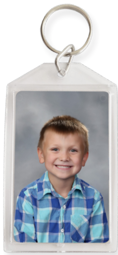
2" Plastic Double-Sided Keychain - $2.51