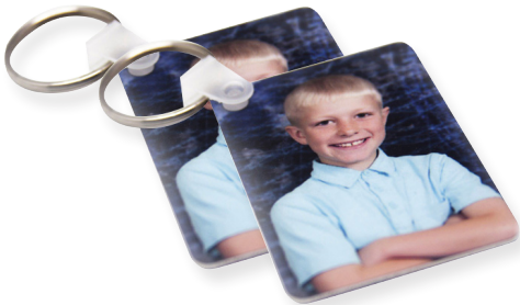
Double-Sided Metal Keychain - $10.17 Double-Sided Metal Keychains (2 up) - $18.66