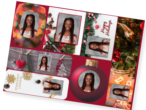
Laminated Fun Pack* - $5.11 each Includes 2 magnets, a ruler, 2 bookmarks, and 2 bag tags