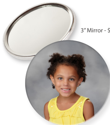
3" Mirror - $2.55