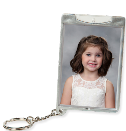
Lighted Keychain - $4.35 Lighted Keychain (2 up) - $5.98