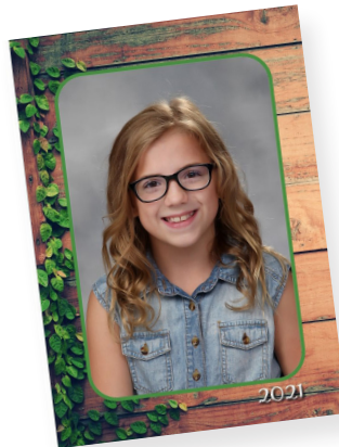
Designer Wallets (8 up) - $1.25