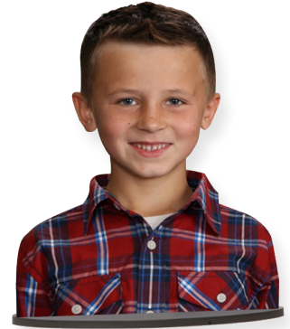
5x7 Black Statuette (1 head) - $18.32 5x7 Clear Statuette (1 head) - $17.03 8x10 Black Statuette (1 head) - $26.37 8x10 Clear Statuette (1 head) - $20.26