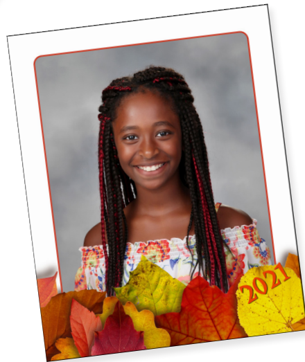
8x10 Keepsake Design - $1.25