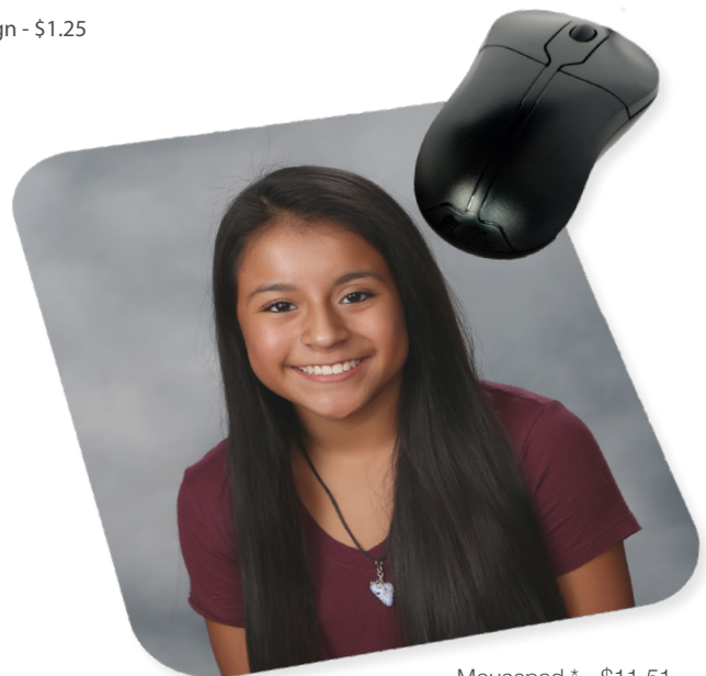
Mousepad * - $11.51

Single-Sided Photo Dog Tag with Chain (no silencer) - $8.89 each Double-Sided Photo Dog Tag with Chain (no silencer) - $11.82 each