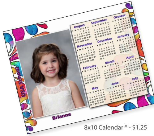
8x10 Calendar * - $1.25