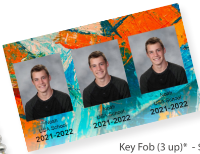
Key Fob (3 up)* - $3.05