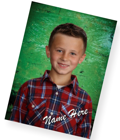
Signature Wallets (8 up) - $1.25

Lab time varies upon product. Visit our website for more product listings.