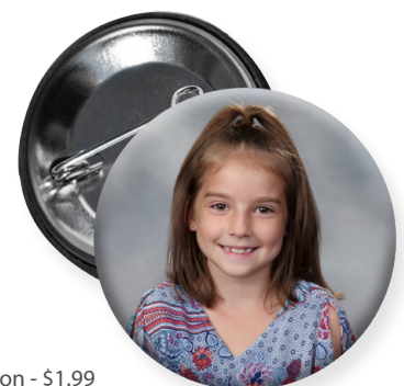
3" Button - $1.99 3" Button (2 up) - $3.34