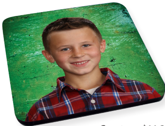
Coaster - $11.36 each Set of 4 - $36.78