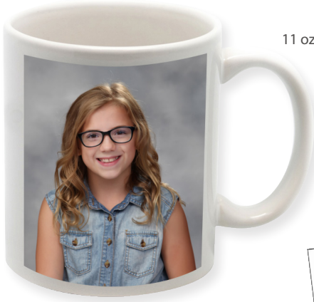
11 oz Coffee Mug - $16.60

5 x10 Dry Erase Board (available upon request) - $10.94 8x10 Dry Erase Board (available upon request) - $11.64