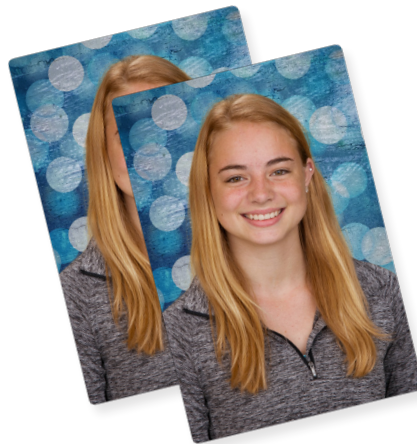
Wallet Sized Magnet - $2.40 Wallet Sized Magnets (2 up) - $4.07 Wallet Sized Magnets (4 up) - $6.15