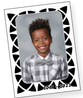
Graphic Wallets (8 up) - $1.25