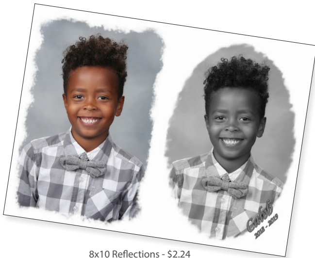
8x10 Reflections - $2.24