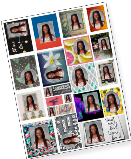
Sticker Sheet* - $2.02 per sheet Includes 19 different stickers